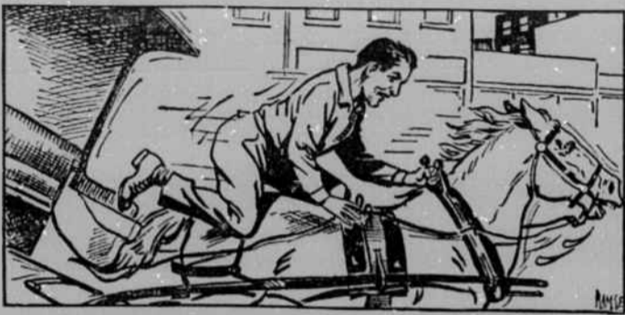
He was headed for the path of a moving train.

He passed the twelfth floor without even hesitating, but cleven was his lucky number. At the eleventh floor another protruding plank caught