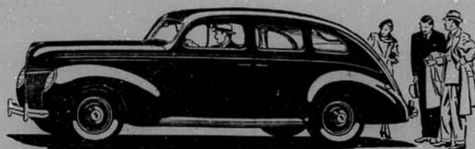
De Luxe Ford V-8 Fordor Sedan $769★