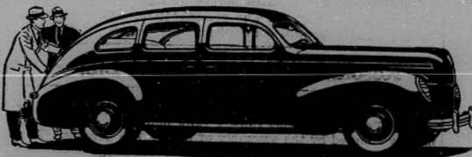
The Mercury V-8 Town-Sedan $934★

MERCURY 8: An entirely new car. Fits into the Ford line between the De Luxe Ford and the Lincoln-Zephyr. Distinctive styling. 116-inch wheelbase. Unusually wide bodies. Remarkably quiet. Hydraulic brakes. New 95-hp. V-8 engine.