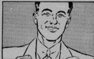
2. You should feel relief very quickly. If pain is unusually severe, repeat according to directions.