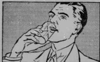
1. Take 2 Bayer Aspirin Tablets with a full glass of water the moment you feel either a rheumatic or neuritic pain coming on.

Just Do What You See In These Pictures To Relieve Pain Quickly