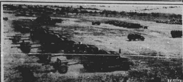
KNOX AT DIX ... Scene as 165th Field Artillery passed in review as 44th Division's 17,000 men and 1,500 vehicles paraded at Fort Dix, N. J., in honor of Secretary of Navy Frank Knox, guest of veterans' association annual meeting.