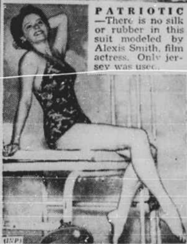
PATRIOTIC —There is no silk or rubber in this suit modeled by Alexis Smith, film actress. Only jersey was used.

IN PACIFIC ACTION! —A dramatic picture made somewhere in the Pacific with a U. S. Navy offensive patrol force. Navy dive bomber is circling her mother carrier while both craft are on anti-submarine patrol duty. White patches indicate details eliminated by Navy censor.