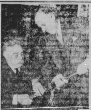
GETS JAP SWORD —Francis B. Sayre, High Commissioner in the Philippines, presents a Samurai sword to President Roosevelt. The sword was taken from body of a Japanese general.