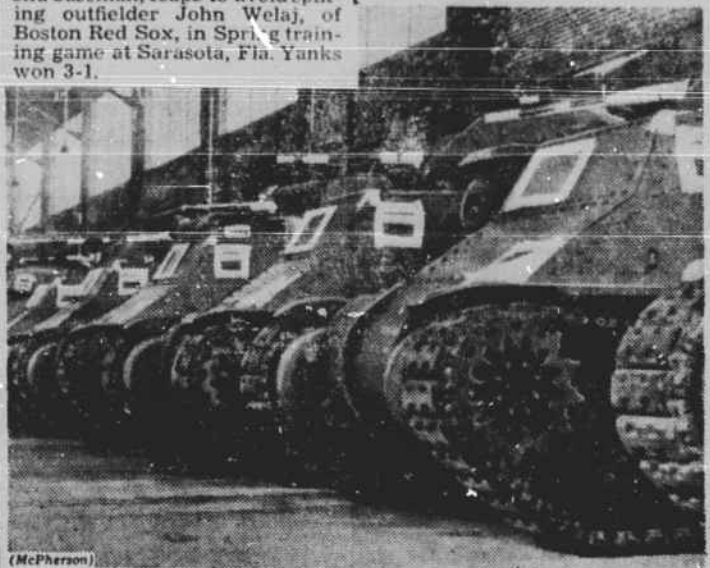
'STANKS A MILLION' —Millions of dollars worth of medium tanks are coming off production lines of Pullman-Standard Car Manufacturing company. A builder of railway rolling stock in peacetime, company now is 95% geared to output of war weapons and freight cars to carry them in.

president, in the chair. This was followed by ice cream and cake served to the following: