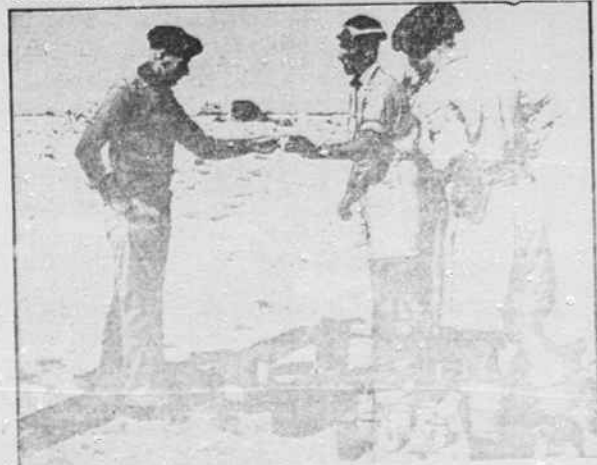
CAIRO, EGYPT—This radiophoto sent from Egypt by New York showing General Montgomery, left, Commander of the British Eighth Army that is pursuing the German Africa Corps across the desert, sharing a pot of tea with one of his tank crews who have paused for a few moments. What appears to be wrecked vehicles show in the background.