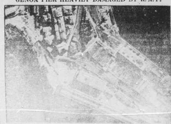
GENOA, ITALY—One of a series of reconnaissance photos was over Genoa after the series of heavy bombing attacks on this important Italian seaport. This picture shows the warehouse and other structures on an area of 2 1/2 acres on the Mole pier) Verchio pier completely destroyed by fire. The R. A. F. estimate damage by their bombs and incendiaries has been calculated roughly 77 acres in the dock area and 100 acres section of the town. Note many barges at lower left.