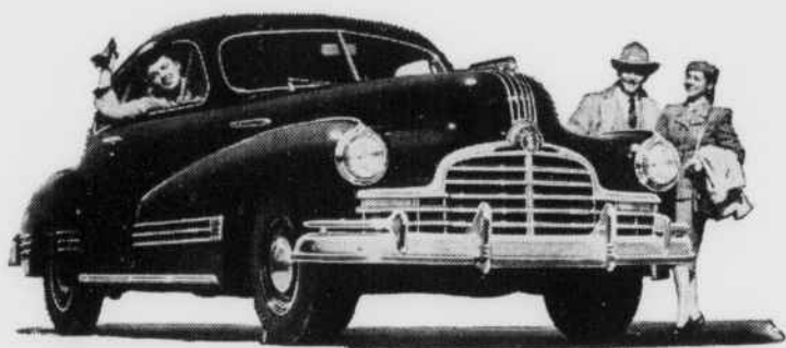
FINEST OF THE FAMOUS "SILVER STREAKS"

It pays to wait for something you really want!