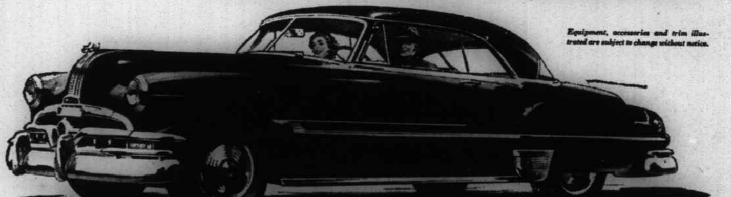
Equipment, accessories and trim illustrated are subject to change without notice.

DOLLAR FOR DOLLAR YOU CAN'T BEAT A PONTIAC!