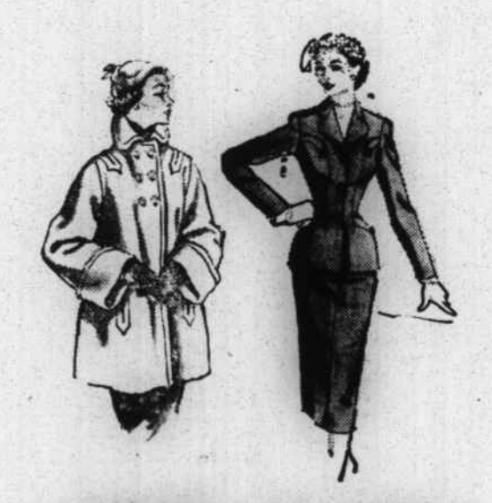
TOPPERS AND SUITS 5.98 to 29.98