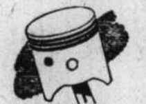
CAST IRON ALLOY PISTONS