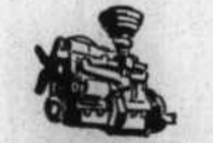
MOST POWERFUL VALVE-IN-HEAD ENGINE