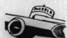
POWERGLIDE AUTOMATIC TRANSMISSION* *Optional on De Luxe models at extra cost.

See all these exclusive features of Chevrolet for '52