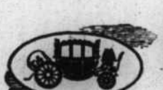
BODY BY FISHER