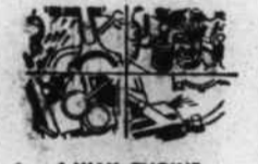
4-WAY ENGINE LUBRICATION