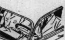
E-Z-EYE PLATE GLASS

...yet it's the lowest-priced line in its field!