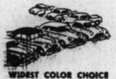
WIDEST COLOR CHOICE

See all these exclusive features of Chevrolet for '52