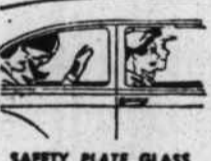
SAFETY PLATE GLASS ALL AROUND