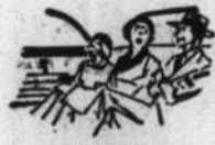
UNITIZED KNEE-ACTION RIDE