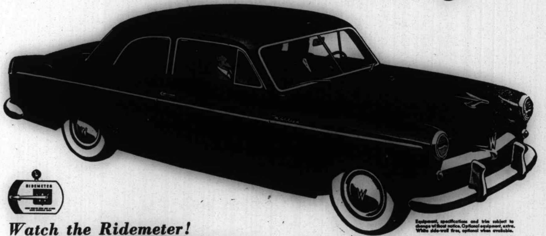
Equipment, specifications and trim subject to change without notice. Optional equipment, extra. White side-trail tires, optional when available.

We invite you to be one of 1,000,000 people who, will Take an "Airborne" Ride in the New Aero Willys