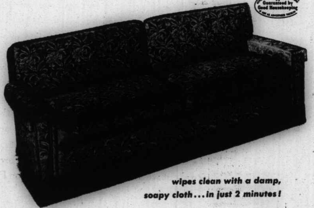
wipes clean with a damp, soapy cloth... in just 2 minutes!

Got a feet-on-the-furniture husband? Grimy-fingered tots? Pets? Here's a superb Lawson sofa that carries its own insurance...upholstered in amazing Firestone Velon. Your choice of Carnation and many high-style new patterns—that look like expensive brocatelles and matelassés. They're embossed with the warmth and depth of costliest fabrics. And Velon, in a sunset of decorator's choice colors—from misty pastels to bold, deep tones—laughs off dirt, scuffing and wear. Say goodbye to "hands-off" furniture. Stop in today and see this Lawson sofa—as well as other smart styles in sofas, easy chairs, occasional chairs—upholstered in Firestone Velon.