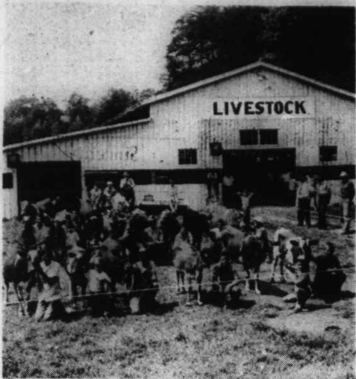
PRIZE HEIFERS-Above are a group of heifers shown at the Nantahala Grade Dairy Show. All are a result of artificial insemination. Entrants came from Cherokee, Clay, Macon and Graham Counties in North Carolina and Union and Towns Counties in Georgia.