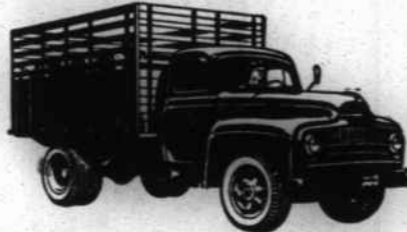
Double-duty! With a combination stock rack and grain body, the L-160 series is a real favorite with farmers. In 130, 142, 154, and 172-in. wheelbases.

Because International offers a complete range of medium-duty models, you're bound to find "the one" best suited for your job. This means extra years of service, big savings on gas and oil, remarkably low maintenance costs. These are just a few of the reasons why you should consider an International. Come in and get the whole story.