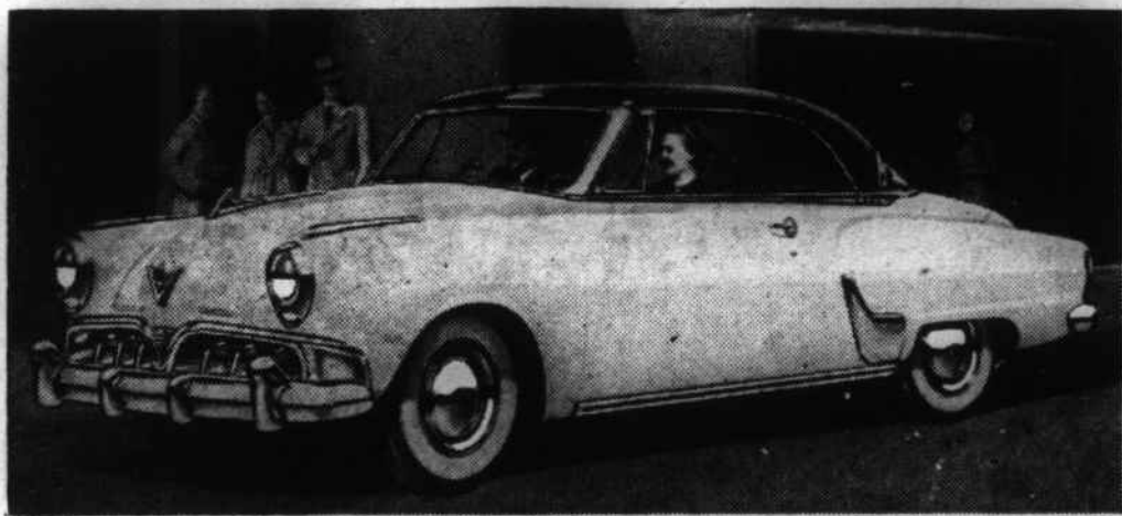
Illustrated: State Commander V-8 Starliner. White sidewall tires and chrome wheel discs optional at extra cost.

Give your family a surprise for Christmas!