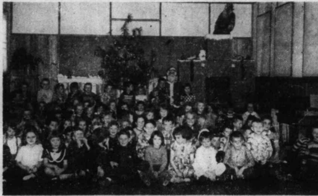
Santa Claus posed with Murphy School children before hurrying back to the North Pole to finish up on last minute Christmas plans. He visited the school Friday with treats for all the children at a party planned by the PTA.