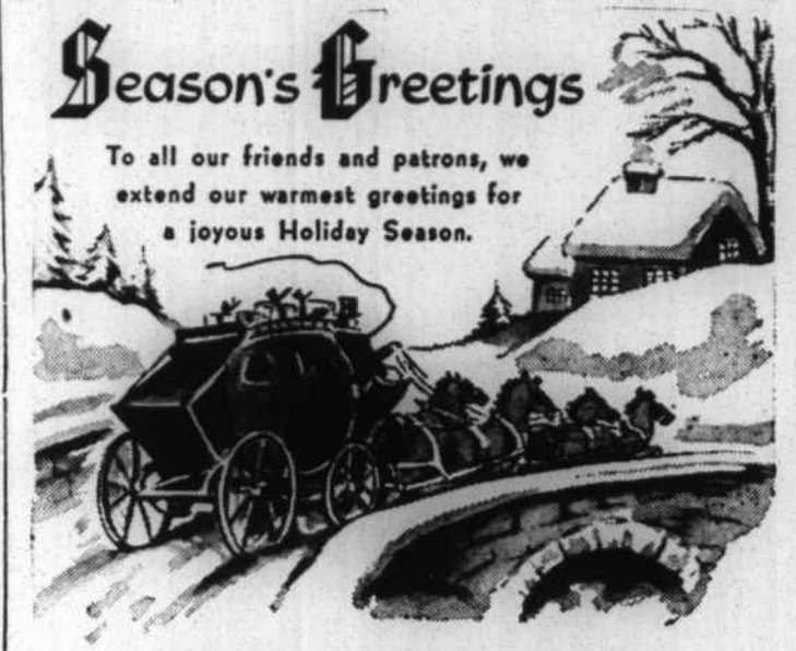
MURPHY FOOD STORE MURPHY, N. C.