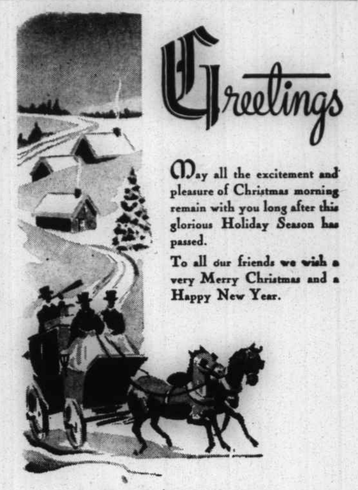
MAUNEY DRUG CO. Murphy, N. C.

Come all ye faithful... It's not easy to express in cold type the warm appreciation we have for the loyalty and good will of our many friends. Our sincere thanks for your friendship is second only to the pleasure we've had in serving you. To one and all we wish a joyous Christmas and a bountiful New Year.