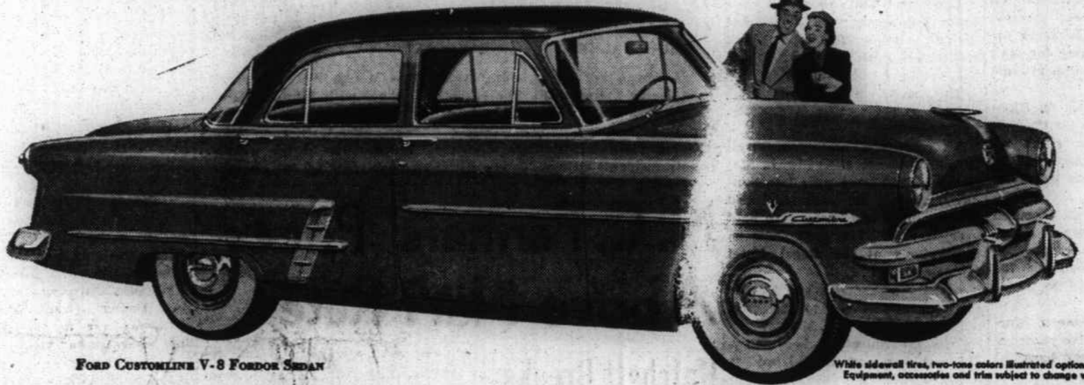
FORD CUSTOMLINE V-8 FORDOR SEDAN