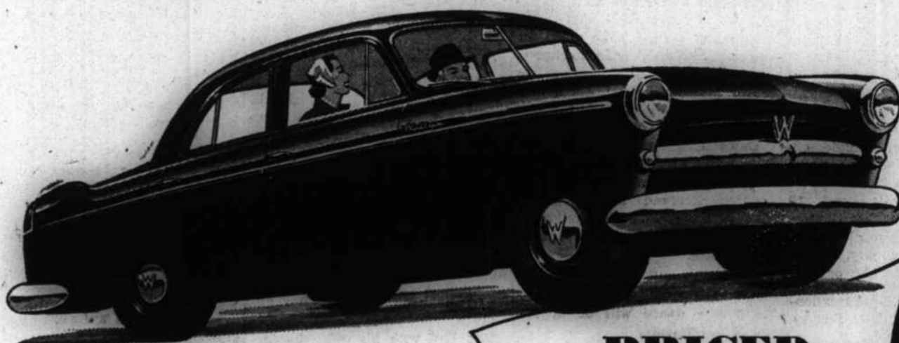
Illustrated—Aero-Lark 4-Door Sedan

Aero-Willys ... the "BUY-WORD" for style... economy and Great Road Performance!