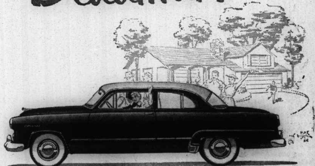
Specifications and equipment subject to change without notice.