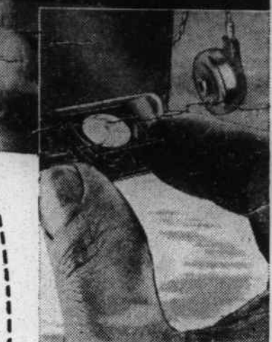
This tiny power pill replaces any two former "A" and "B" batteries shown above in comparative sizes.

This tiny power pill is all you need in Acousticon's great, new 2-Transistor Hearing Aid to give you new hearing power and clarity that is positively amazing. It completely eliminates old and larger "A" and "B" batteries, making possible the tiniest, lightest hearing aid transmitter we have ever created. Come in today for an absolutely free demonstration. See and try all the wonders of the A-330. . . our answer to your dream of a miracle hearing device.