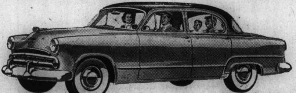
DODGE CORONET V-EIGHT 4-DOOR SEDAN

Powerful brakes, capable of developing more than 700-h.p. in stopping power, team up with the Red Ram V-Eight engine to bring you new mastery of every driving situation.