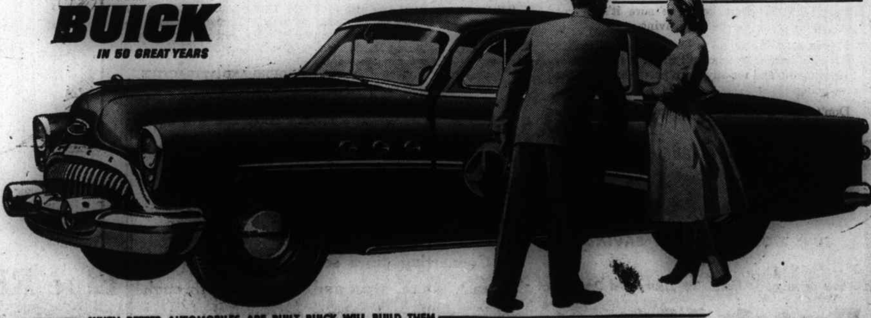
WHEN BETTER AUTOMOBILES ARE BUILT BUICK WILL BUILD THEM