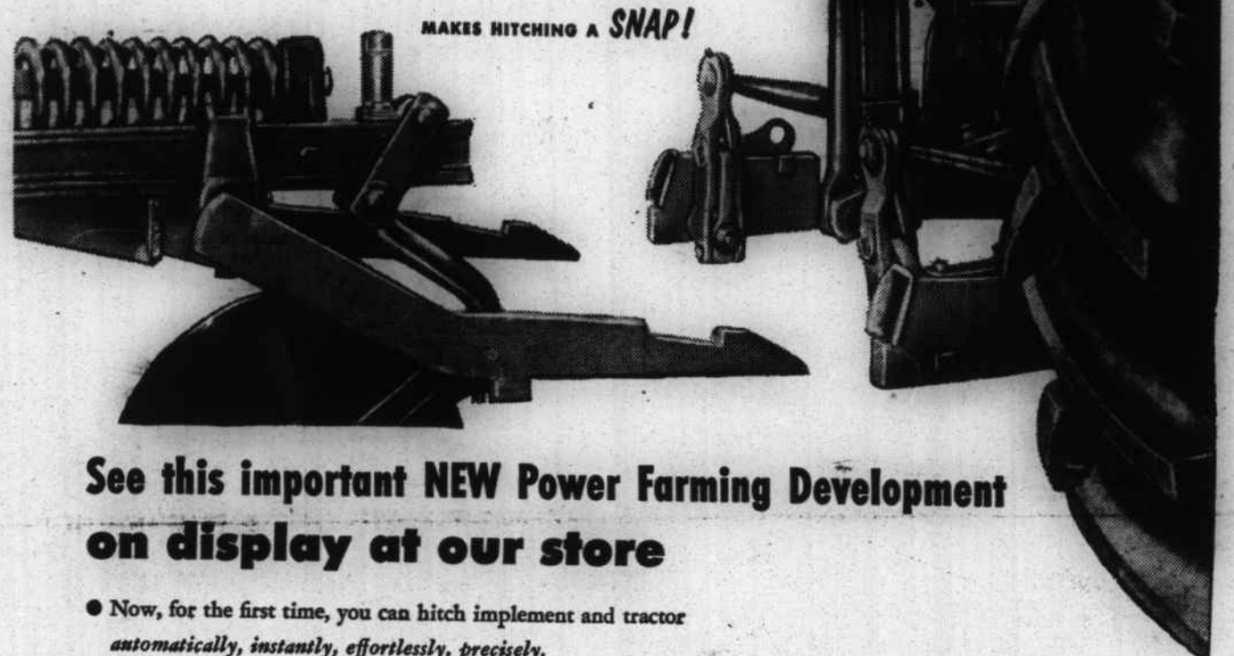
MAKES HITCHING A SNAP!

See this important NEW Power Farming Development on display at our store