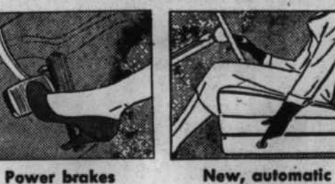
th POWER BRAKES, AUTOMATIC WINDOW and SEAT CONTROLS