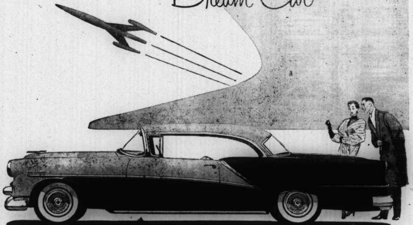
Ninety-Eight Deluxe Holiday Coupé. White sidewall tires, special Two-tone treatment optional at extra cost. A General Motors Value.