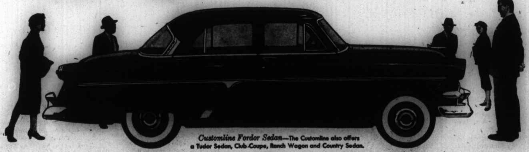
Customline Fordor Sedan—The Customline also offers a Tudor Sedan, Club Coupe, Ranch Wagon and Country Sedan.