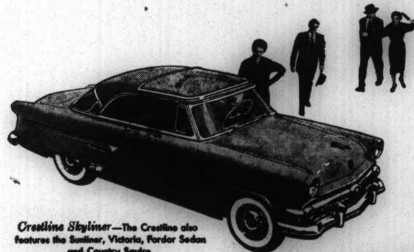
Crestline Skyliner—The Crestline also features the Sunliner, Victoria, Fordor Sedan and Country Squire.

the 1954 Ford is fast becoming America's favorite.