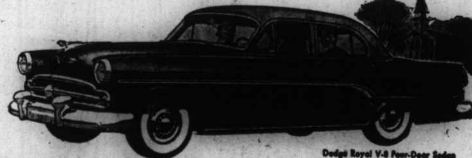
Dodge Royal V-8 Four-Door Sedan