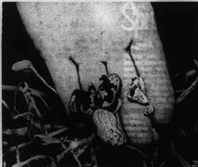
Punctured, broken pods, stunted plants—that's the result of Southern corn rootworm attacks. But now farmers are going underground to destroy many pests with aldrin, a new insecticide.