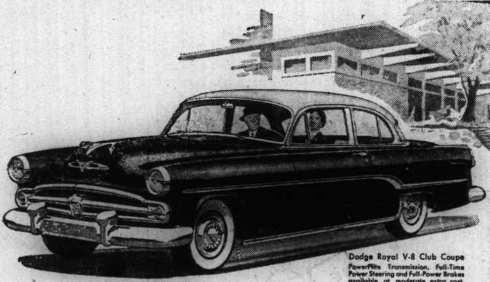
Dodge Royal V-8 Club Coupe PowerFlite Transmission, Full-Time Power Steering and Full-Power Brakes available at moderate extra cost.