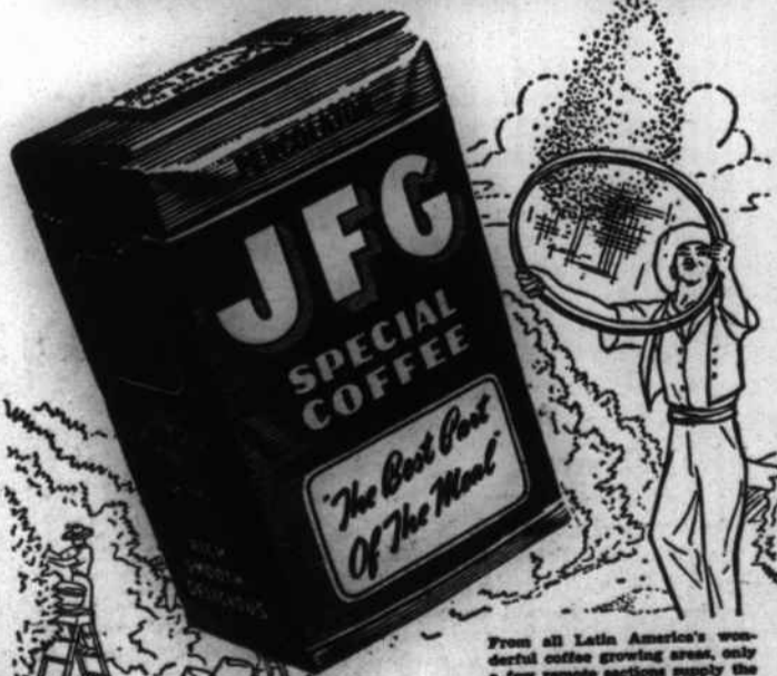
From all Latin America's wonderful coffee growing areas, only a few remote sections supply the choice "Premium Flavor" coffees that go into JFG Special.

Every ounce of JFG Special coffee is "PREMIUM FLAVOR" coffee!