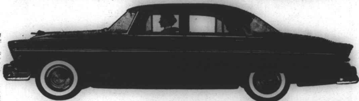
Actual photo of the Plymouth Belvedere 4-door Sedan, powered by the new 6-cylinder PowerFlow 117