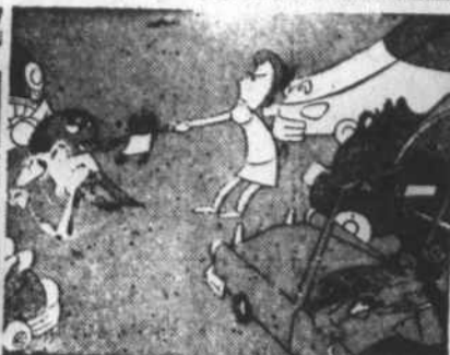
Appeared to Charlie like children fighting over possession of a doll.