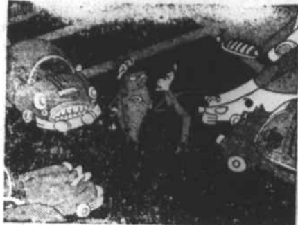
Motorist held up traffic while waiting for the right of way...