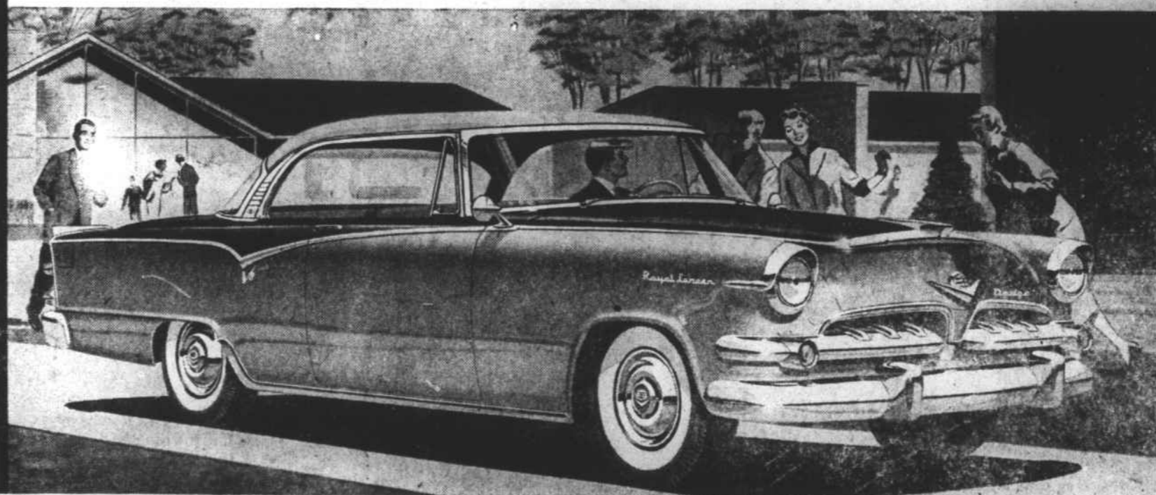
New Dodge Custom Royal Lancer in dramatic three-tone styling.

So head for your Dodge Dealer . . . and take your pick!