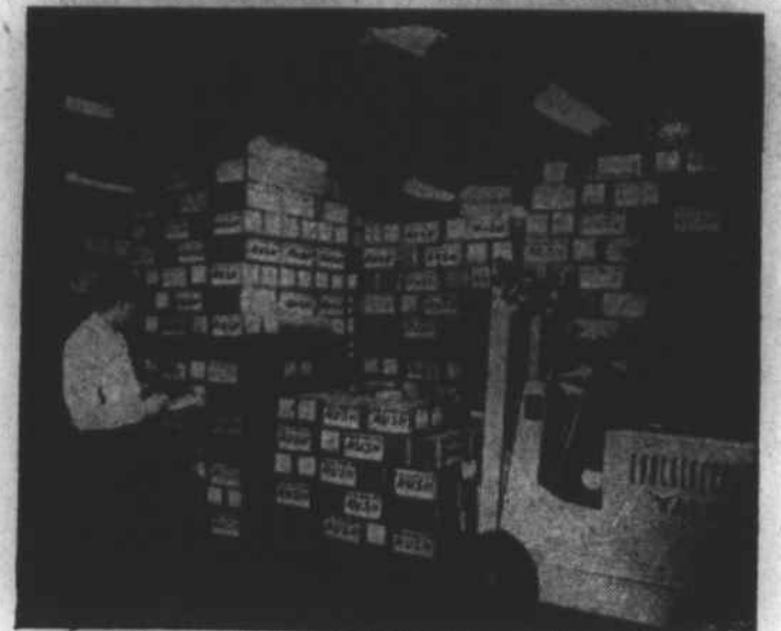
In handling the Salk polio vaccine to safeguard the nation's children against poliomyelitis, the rule is "RUSH" but "gently". This is done at the Eli Lilly plant with the aid of modern industrial lift trucks which speedily and safely move and stack the packaged life-saving vaccine. Illustrated here is the manner in which the polio vaccine was handled for shipment to inoculate the school children of this state.