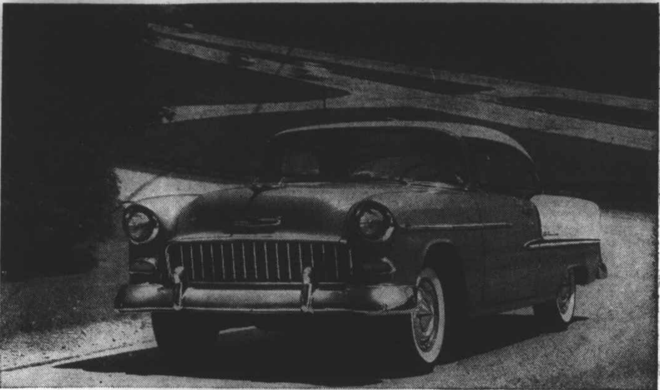
Great Features back up Chevrolet Performance: Body by Fisher—Ball-Race Steering—Outrigger Rear Springs—Anti-Dive Braking—12-Volt Electrical System—Nine Engine-Drive Choices.

The new Chevrolet has proved itself all K-I-N-G in today's toughest driving competition! Starting at the Daytona Beach NASCAR*-sponsored trials last winter, the new Chevrolet swept aside all competition in its class in acceleration tests. Since then what's happened: The latest figures on hand show that so far Chevrolet has piled up a big lead in NASCAR short track events against all comers in all price classes! Come on in and try America's real honest-Injun GO car of the year! *National Association for Stock Car Auto Racing Drive with care . . . EVERYWHERE!