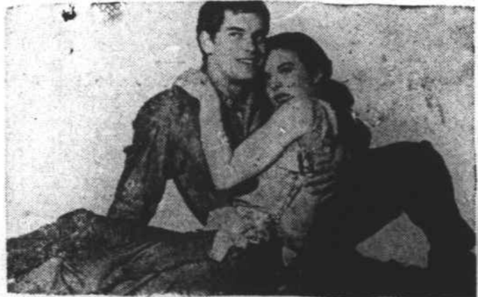
Jeffrey Hunter and Jean Peters in a romantic embrace, from 20th Century Fox's "Lure of The Wilderness." Technicolor