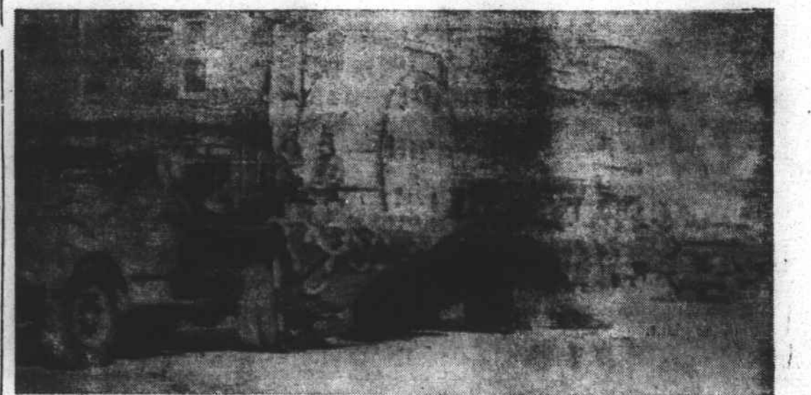
THIS GIANT BASS drum was featured on the second place winning float of the Murphy Band Boosters Club. The float was decorated in orange and black, the Murphy School colors. First prize winning float was a five-car train depicting projects of the Lions Club. Seen to the right in the above picture is Santa's jeep, with Santa making his fourth annual appearance in a Murphy Christmas parade.