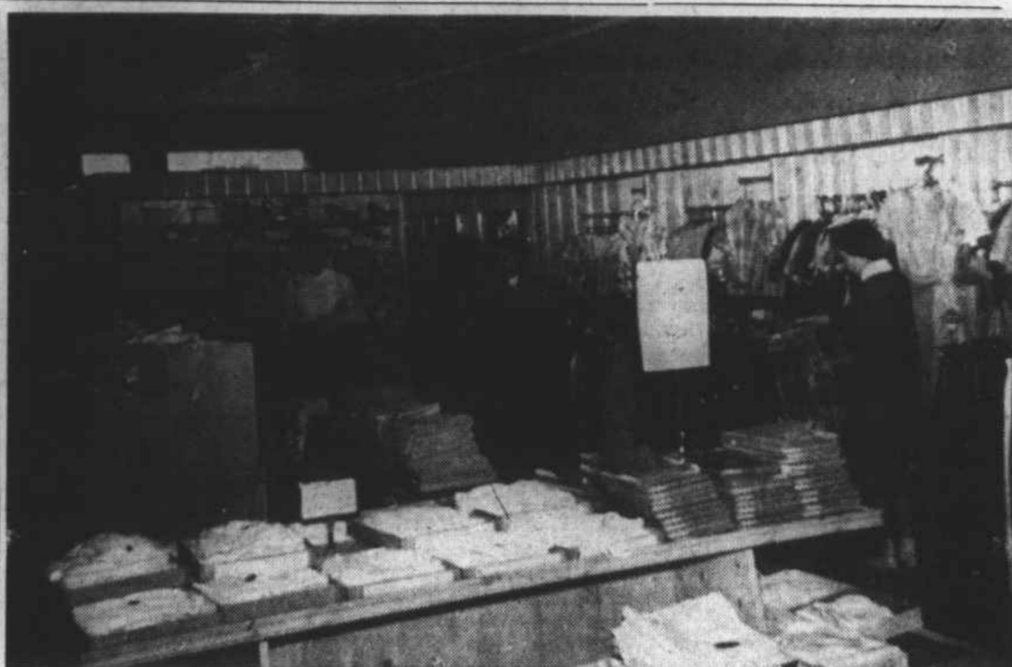
TRUDY'S GRAND OPENING: More than 2,000 persons attended the grand opening of Trudy's new Store Friday and Saturday, Mrs.