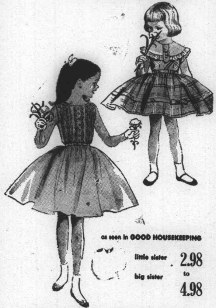
as seen in GOOD HOUSEKEEPING