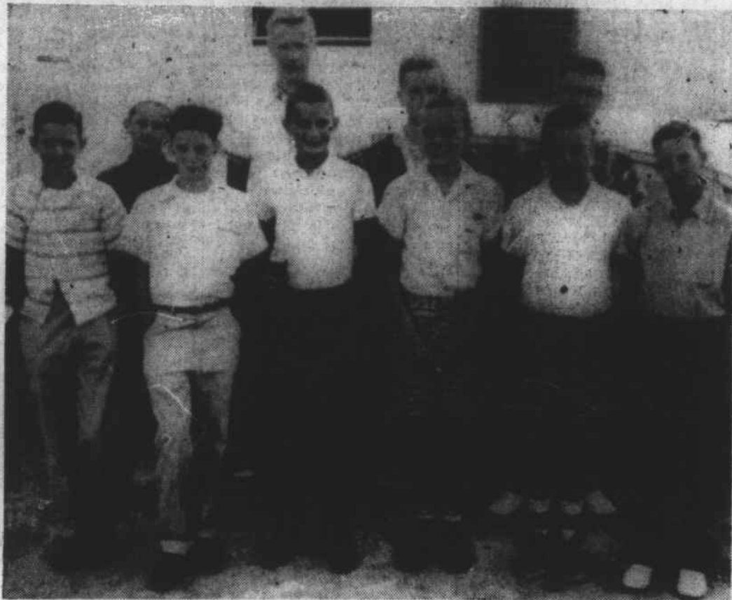
CHEROKEE SCOUT GROUP GOES TO CAMP