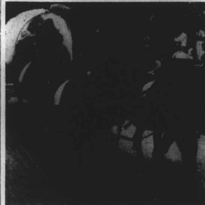
MULES MADE GOOD SHOWING