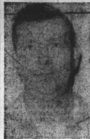
No. 1 In A Series