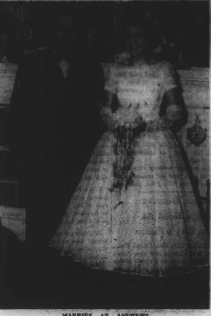
MARRIES AT ANDREWS

Ga., where the groom is employed. of Wren, Ga.