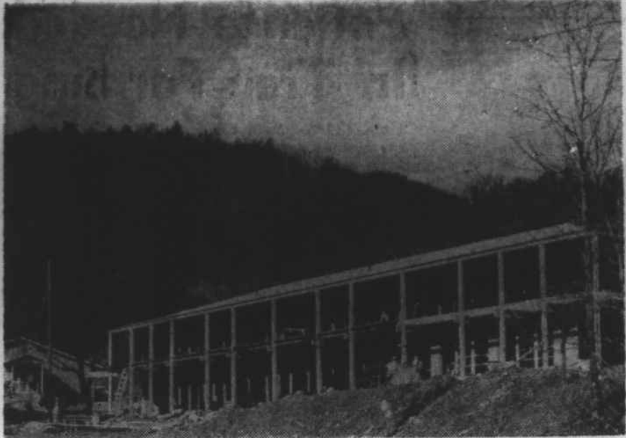
NEW DORMITORY FOR 'UNTO THESE HILLS'

A new girls' dormitory, being constructed and furnished at a cost of $70,000 at Cherokee, N.C., as additional housing for the cast of the out-door drama, "Unto These Hills," is 35 per cent complete and will be ready for use about April 15. The building, which contains 9,600 square feet of floor space, is shown in its present state of construction.