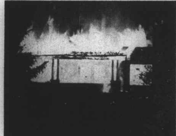
Hours Pass . . . Fire Dwindles