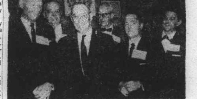
ATTEND JORDAN GET-TOGETHER