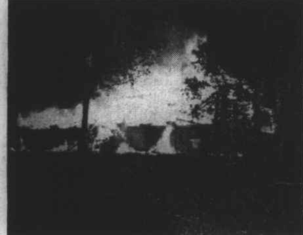
Camera Records Peak Of Fire

Nominations will be made for State Representative, county surveyor, township officers and County Board of Education.