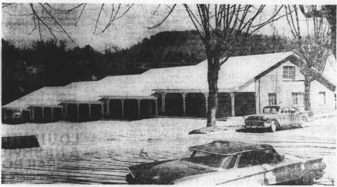
Murphy's most modern office building is all-electric. It features the newest designs in lighting, modern wiring and electric heating. One office suite utilizes the heat pump.