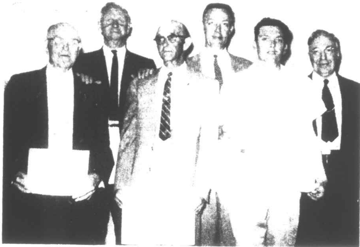
MASONS HOLD HONORS AND LECTURE PROGRAM