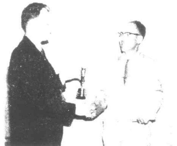
CIVITAN OF THE YEAR