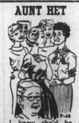
she'd be When knew 0 hardlooker. 0 woman's friends can't talk about anything but her charm, it means she ain't much to look at.

At one time nine boats and coming here, he served as pastor over twenty five men were eng- of the First Baptist Church , Easaged in the search. ley, S. D., and the First Baptist