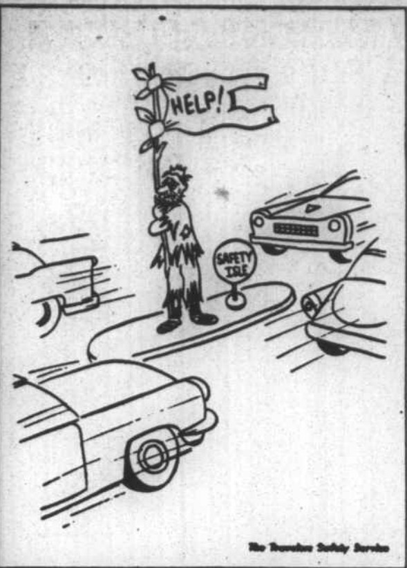
The Treasurer Safety Service

About 250,000 pedestrians were killed or injured in motor vehicle accidents in 1959.