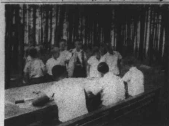
Registration At Camp Ney-A-Ti