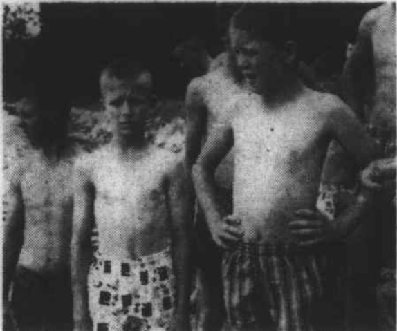
SURE COACH, I CAN SWIM